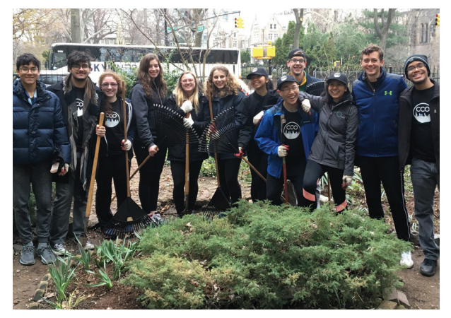
Members of the Class of 2018 volunteer to clean up a local park as a part of Columbia Community Outreach.