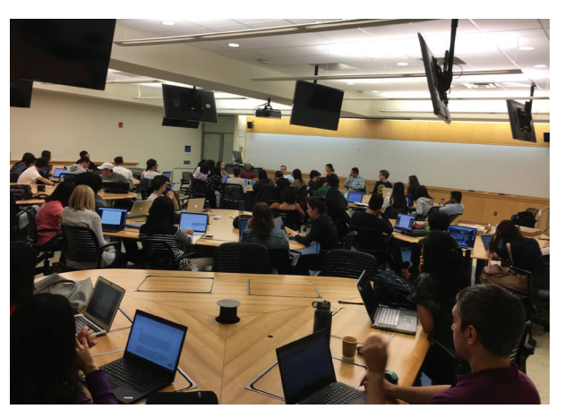
Students participating in the the department's new Columbia Biostatistics Computing Club (October 2017).