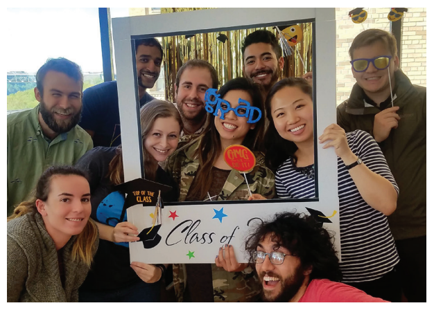
Members of the Class of 2017 celebrate graduation!